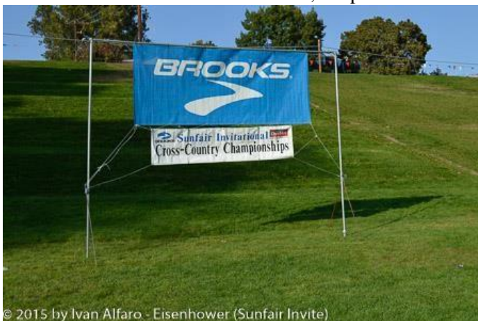
Eisenhower (Sunfair Invite)

***After Sunfair Invite, the photos will be uploaded into the webpage and Facebook Page!***